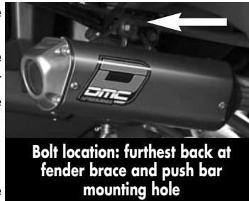
Bolt location: furthest back at fender brace and push bar mounting hole