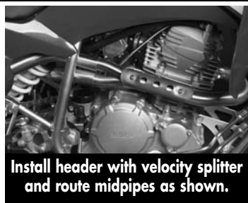
Install header with velocity splitter and route midpipes as shown.