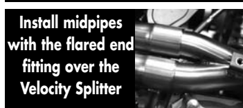
Install midpipes with the flared end fitting over the Velocity Splitter